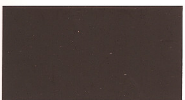
Regal Brown NEWLAR™ PF4228T ARC 2001™ PSP4212W