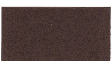
Weathered Brown NEWLAR™ PF1863Q ARC 2001™ PSP280083