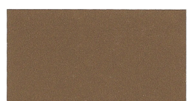
Medium Bronze NEWLAR™ PFY3837Q ARC 2001™ PSPY3869Y