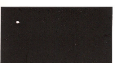
Coal Black NEWLAR™ PF3984C ARC 2001™ PSP3960D