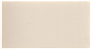
Sandstone NEWLAR™ PF4276T ARC 2001™ PSP4210W