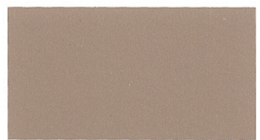
Champagne NEWLAR™ PFY3806Q ARC 2001™ PSPY3867Y