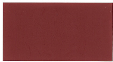
Colonial Red NEWLAR™ PF4468G ARC 2001™ PSP4416K