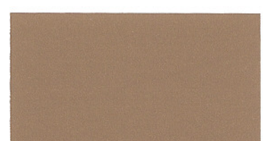
Light Bronze NEWLAR™ PFY3836Q ARC 2001™ PSPY3868Y