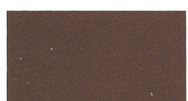
Dark Bronze NEWLAR™ PFY3838Q ARC 2001™ PSPY3870Y

from actual coating due to the effects of heat, light and manufacturing process.